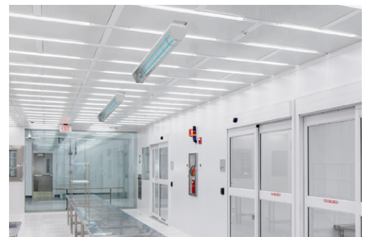
Application in an industrial environment

UVGI technology is a physic disinfection method with a great cost/benefits ratio, it's ecological, and, unlike chemicals, it works against every microorganisms without creating any resistance.