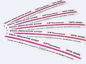
VH 2 O 2 Class 4 CI Strip