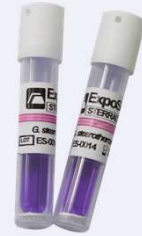
Compatibility : 3M, GKE, ASP