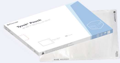
60pcs / Box 300mm X 400mm