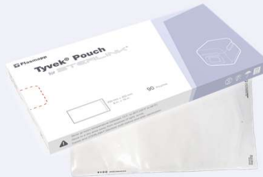
90pcs / Box 200mm X 400mm