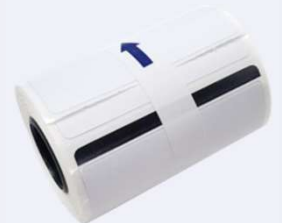
Easy peel sticker