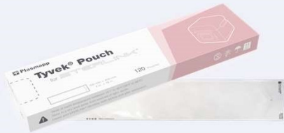
120pcs / Box 100mm X 400mm