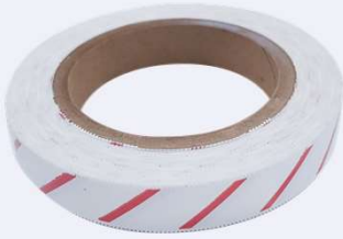
VH 2 O 2 Class 1 CI Roll