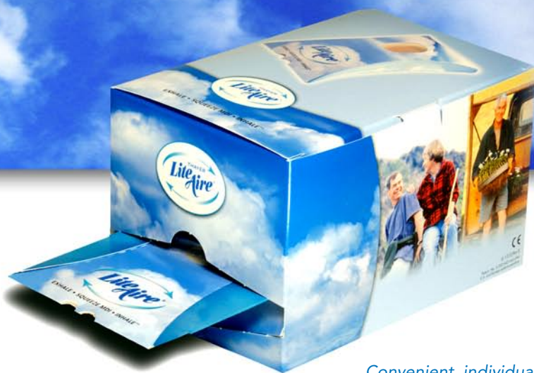
Convenient, individually packaged, 25-count dispenser box