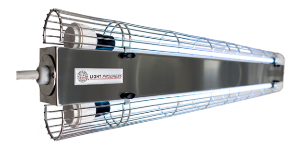
Dual lamp model