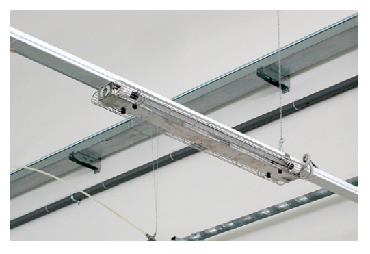
Application in an industrial environment

UVGI technology is a physic disinfection method with a great cost/benefits ratio, it's ecological, and, unlike chemicals, it works against every microorganisms without creating any resistance.