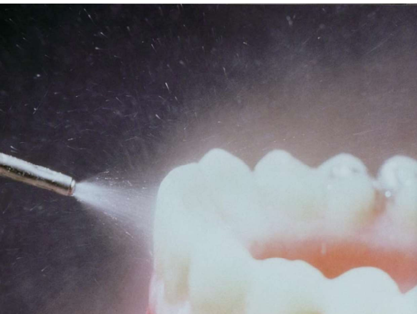
Figure 2. The visible aerosol cloud, made up of water and abrasive at the levels recommended by the manufacturer, produced by an air polisher.

was based on the assumption that all patients may have an infectious bloodborne infection, such as with hepatitis B virus, hepatitis C virus and HIV. It also should be assumed that all patients may have an infectious disease that has the potential to be spread by dental aerosols; thus, universal precautions to limit aerosols also should be in place.