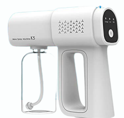
380ML K5 NANO SPRAY GUN