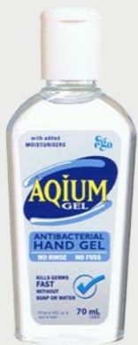
60 ml Purse Pack