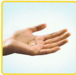
Dispense 1-2 pumps of Aqium hand gel