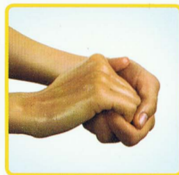
Palm over back of each hand