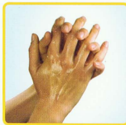
Palm to palm vigorously with interlocked fingers