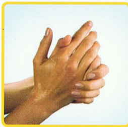
Rub vigorously palm to palm