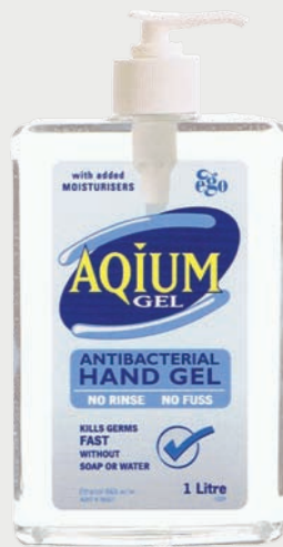
1 L Pump Pack