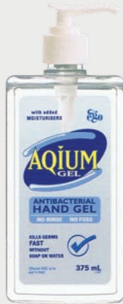
375 ml Pump Pack