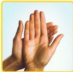
Tips and bottoms of fingers to each palm