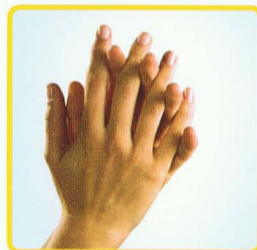
Keep rubbing until Aqium hand gel is dry

Aqium kills germs fast without soap or water